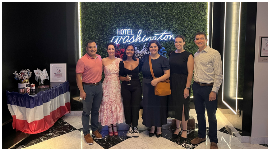
HRES, Hotel Washington Event