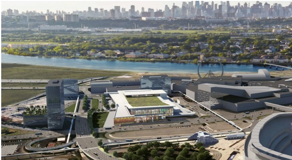
Rendering of the Proposed Convention Center Complex

Local officials are enthusiastic about this opportunity to reinvigorate the Meadowlands and northern New Jersey.