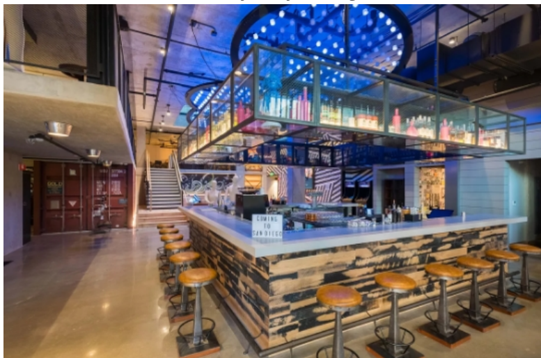
Bar Moxy, Moxy San Diego

Several new hotels opened in 2018, notably the 400-room InterContinental Hotel in Downtown San Diego, across from the International Cruise Ship Terminal. A 98-room TownePlace Suites by Marriott opened Downtown in June, and California's very first Moxy opened in December to much fanfare. This Millennial-minded, 128-room hotel has plenty of playful touches including the innovate lobby "trike," where guests receive their digital room keys. The hotel's food-and-beverage program is anchored by Bar Moxy, offering items such as a signature welcome nitro-cocktail, local craft beers, and coffee from San Diego Coffee Co. Artist Paul Nandee's mural, featuring distinctive lettering and character creations constructed with cubist angles, adorns the back of the hotel and adds to the hotel's creative flair.