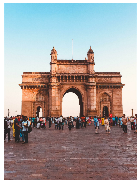
Gateway of India, Mumbai

Using Virtual Reality (VR) and Augmented Reality (AR) content can help make visits to the city's tourist spots unique and exciting experiences for tourists. Many popular international tourist destinations, including the Vatican and the Louvre in Paris, are already successfully utilizing these technologies. We have only begun to explore this opportunity in India, where the Archaeological Survey of India (ASI) has begun offering VR experiences at five historical sites and is also working with the Rajasthan government and the Indian Institute of Technology, Jodhpur, to develop a gaming platform using AR and VR to attract the younger generation.