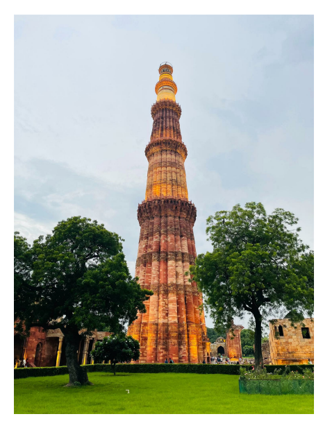
Qutub Minar, Delhi

Even though the majority of Indian cities are endowed with numerous monuments, historical sites, museums, zoological parks, and other tourist attractions, they were unable to draw many visitors before the pandemic. For instance, the Taj Mahal in Agra experienced twice as many visitors in FY20 as Delhi's Red Fort and Qutub Minar. Similarly, according to media reports, the Louvre in Paris experienced 9–10 million visitors annually, while the National Museum in Delhi welcomed 200,000–300,000 visitors annually prior to the pandemic. There are several factors to blame for the decline in city tourism, the most important of which is their inability to engage audiences. Most tourist spots, including heritage sites and museums, in the cities, have activities ranging from