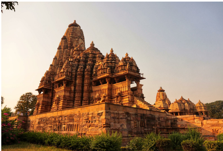
Khajuraho, Madhya Pradesh, India

World Heritage Day, also known as the International Day for Monuments and Sites, is celebrated on the 18th of April every year to raise awareness about the importance of preserving our heritage and culture. Several events and exhibitions were held across India last week to commemorate the occasion. With 40 UNESCO World Heritage Sites and another 49 on the tentative list, India ranks sixth in the world in terms of the number of UNESCO sites. In addition to these, the country has nearly 3,700 centrally protected monuments/sites under the ASI, which showcase India's fascinating history, rich heritage, and culture, attracting a large number of domestic and international visitors each year.