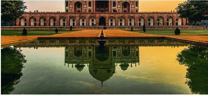
Humayun's Tomb, Delhi, India

Over the years, the Indian government and other tourism stakeholders have worked hard to propel the growth of heritage tourism. Effective marketing campaigns have been implemented and activities ranging from light & sound shows, heritage/cultural walks, and cycle tours to culinary events and festivals have been introduced at the various heritage destinations to attract tourists. However, there is still much more that can be done, especially now that international travel is making its long-awaited comeback.