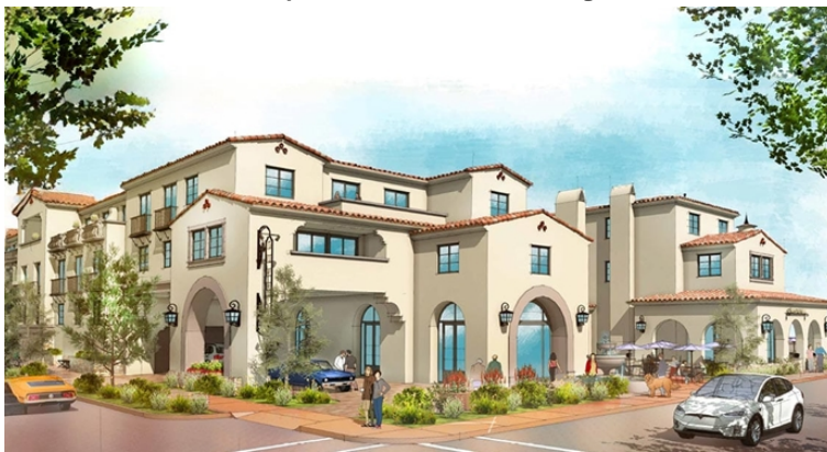
Kimpton Pacific Grove Rendering

Finally, after more than a decade of planning and speculation, a groundbreaking ceremony was held for the 101-room Kimpton Hotel in Pacific Grove in late September 2023. This boutique hotel is expected to open in 2025 and will be the brand's first property within Monterey County.