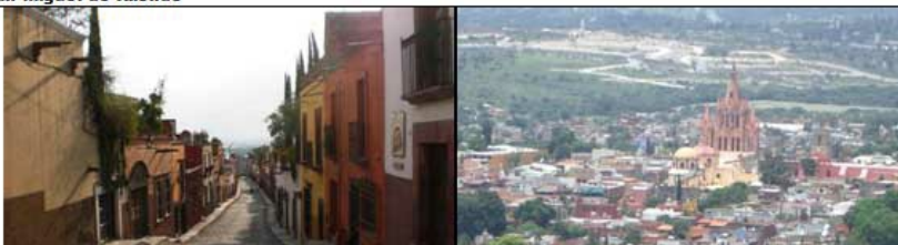
San Miguel de Allende