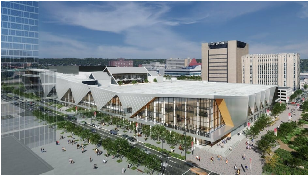
Duke Energy Convention Center