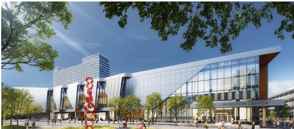
DECC Renovation Renderings

This project is expected to significantly boost the Cincinnati lodging market by attracting larger conferences and events. With enhanced facilities and a more modern convention space, the renovated DECC is anticipated to be more competitive with the other convention centers in the Midwest. Furthermore, the development of the convention headquarters hotel should create sufficient lodging supply to meet the higher levels of convention demand anticipated.